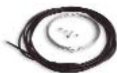
KA1 6m cable release kit for KIO Pc/pack 1