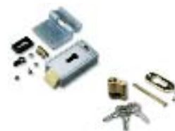
PLA10 vertical 12V electric lock (required for gates longer than 3m) Pc/pack 1