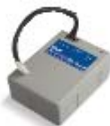
PS124 24V battery with built-in battery charger Pc/pack 1