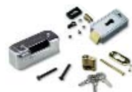
PLA11 horizontal 12V electric lock (required for gates longer than 3m) Pc/pack 1