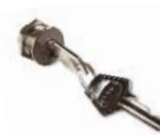
CM-B lock with two metal keys compatible with SELE