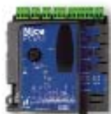
POA1 spare control unit for PP7024