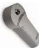
KIO key-operated selector switch for low voltage contacts, with release mechanism for metal cord Pc/pack 1