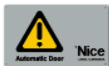
TS signboard Pc/pack 1