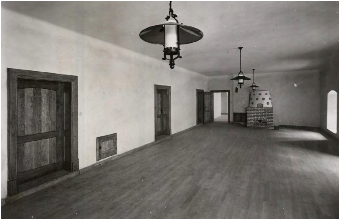
The square tower after the reconstruction for the purposes of the Wehrmacht between 1939 and 1941.