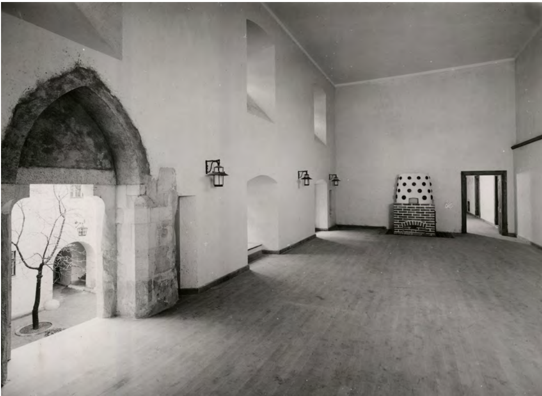
The royal chapel after the reconstruction for the purposes of the Wehrmacht between 1939 and 1941.