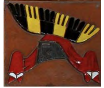
Artistic representation of symbols of the reign of Ottokar II of Bohemia inspired by the so-called crests of the monarch.