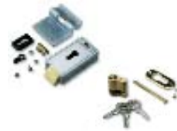
PLA10 vertical 12V electric lock (required for gates longer than 3m) Pc/pack 1