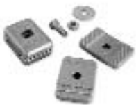
PLA13 travel stops for closing and opening manoeuvres Pc/pack 4