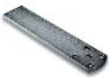
PLA6 rear racket 250mm long Pc/pack 1