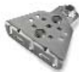
PLA15 screw-adjustable front bracket Pc/pack 2