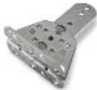
PLA14 screw-adjustable rear bracket Pc/pack 2