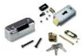
PLA11 horizontal 12V electric lock (required for gates longer than 3m) Pc/pack 1