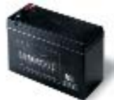
B12-B 12V 6Ah batteries