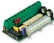
PIU expansion card for control unit