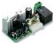
CARICA plug-in card for battery charger for use with A824