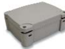
BA3-A Nice box for batteries